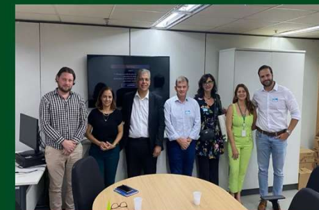
Reunião Abrasem/ Mapa